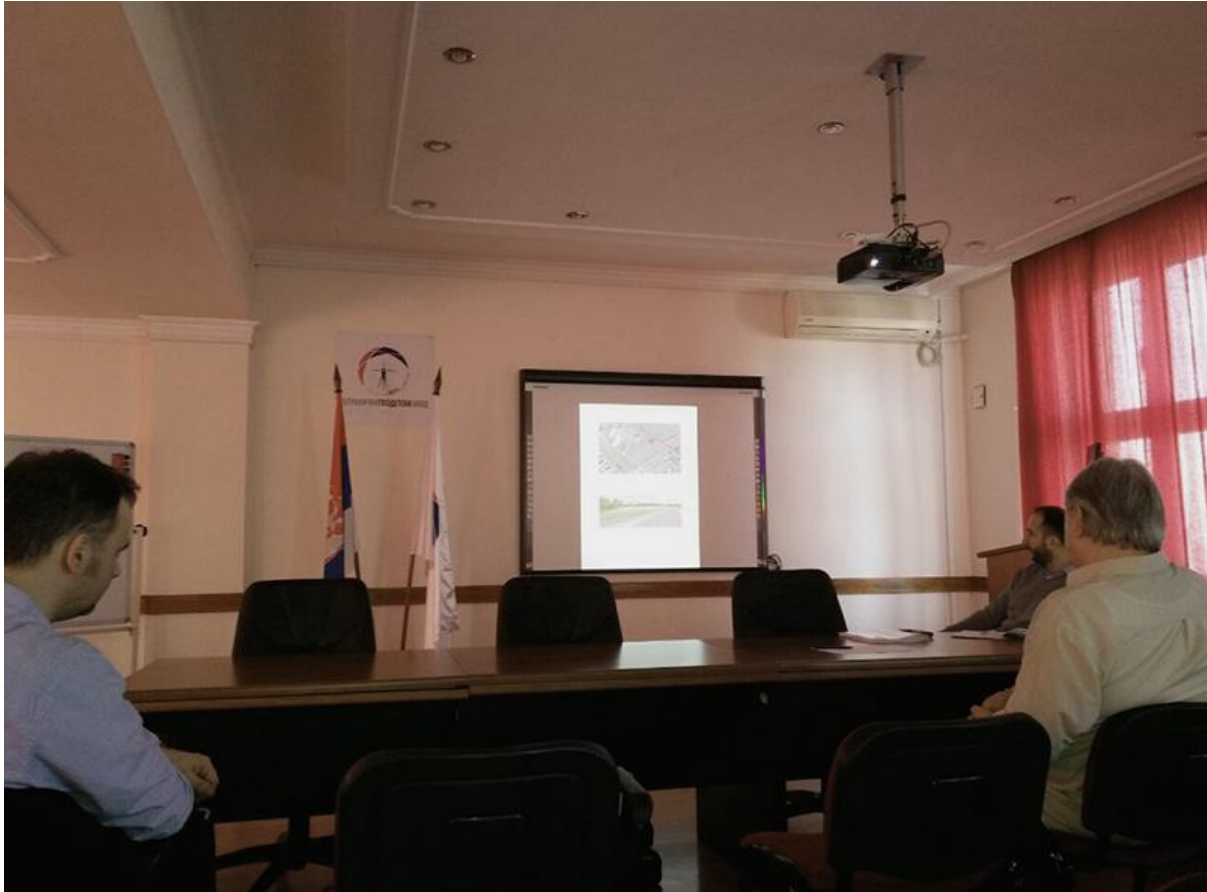
Photo No.1 Public Consultation meeting at RGA's headquarters in Belgrade.

The meeting started according to schedule at 10:00AM. The EMP document was presented in details to the interested attendees by the PIU's representative. During the public consultations there were no significant remarks or comments made in regards to the environmental protection issues.